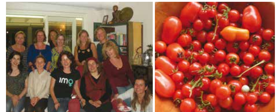
Images from 1MW Recipe for Change: a girls get-together & GYO tomatoes

The Fund has been providing financial support to 1MW since 2011 to assist the establishment of a sustainable fundraising base that will secure its work into the future. During 2012/2013, this support has enabled 1MW to continue strengthening its fundraising strategy, which included a member fundraising activity, Recipe for Change.