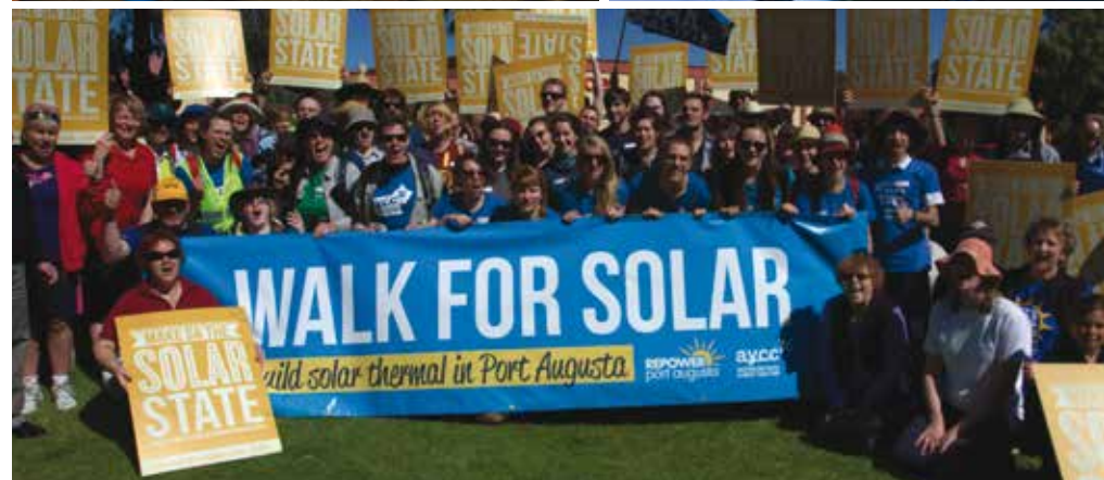
(clockwise from top) Power Shift 2013, Youth Decide, Walk for Solar, and a session panelist of Power Shift 2013