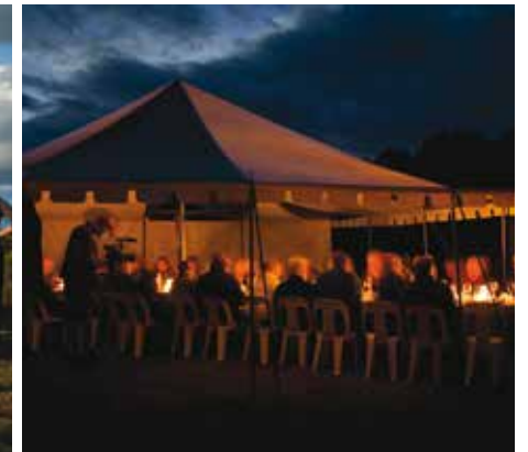
Images from TLC artists retreat