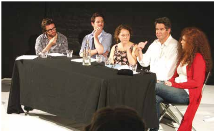
Griffin Theatre Changing the Social Climate forum

G T C R H O I E M F A P F T A I R N N E Y