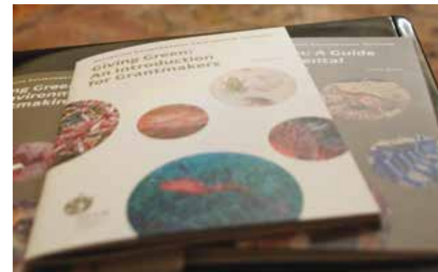
Images from Giving Green events